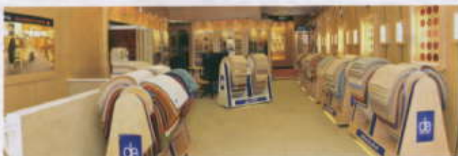
Plenty of choice and friendly, expert advice are a winning combination at Dalkard & Elliott.

So if you're thinking about a new carpet, it makes sense to visit Dalkard & Elliott first for friendly expert advice. There's easy access pay and display parking on Dover Street, just around the corner, and the showroom is just 5 minutes' walk from the new Highcross Centre. You'll be guaranteed a warm welcome, enormous choice and friendly, helpful advice!